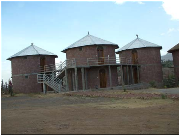
Tukul Village in Lalibela.

Being the non-hardy people we are, we again stayed in a hotel, Tukul Village. It was almost new and was traditionally designed in tukuls , circular stone and thatched huts with pointed roofs.